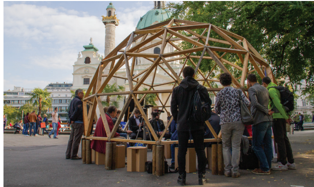
Our talk at Karlsplatz in Vienna, Austria, on 1st October.

In the months and years to come, the mobile, wooden domes of the European Public Sphere will travel across Europe and host participatory debates on the future of the EU in public spaces open to all. We want to create a public space where citizens can discuss openly and freely to reimagine a European project they can believe in.