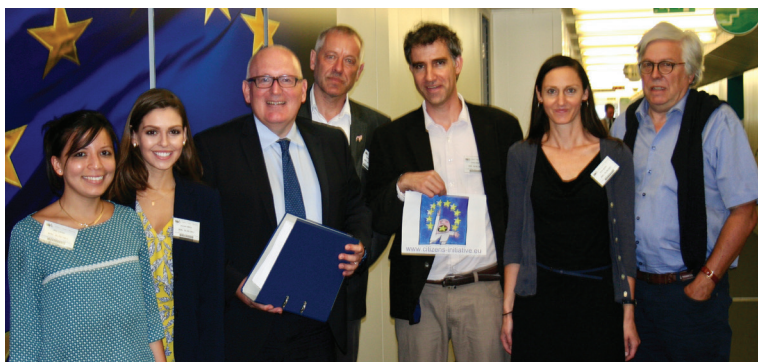
Our meeting with First Vice President of the European Commission Timmermans.

In August, we were invited to a stakeholders' meeting with Mr Timmermans to discuss our proposals. We went to Brussels armed with over 100,000 signatures of citizens asking for an ECI that is more user-friendly, well-known, and legislatively effective. At the meeting, we discovered that we share a lot of common ground: the Commission agrees that the ECI needs to be more well-known by citizens, so that it is less vulnerable to being hijacked by political parties and interest groups.